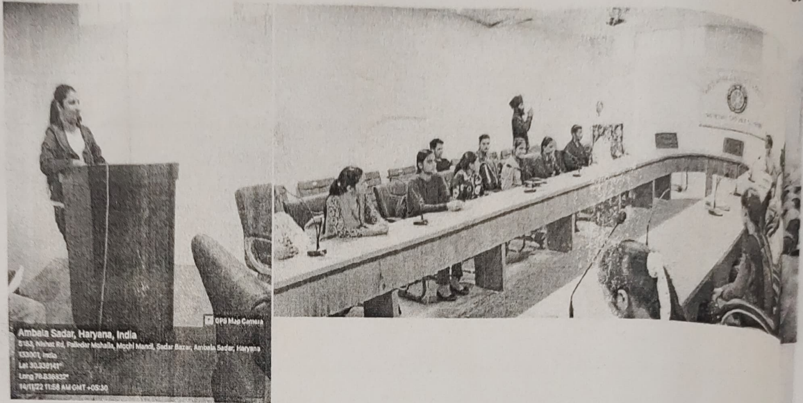
Ambala Sedar, Haryana, India 5155, Nishant Rd, Fardar Mohalla, Mohl Mandi, Sedar Bazar, Ambala Sedar, Haryana 133001, India Lat: 30.339141° Long: 76.836832° 14/11/22 11:58 AM GMT +05:30